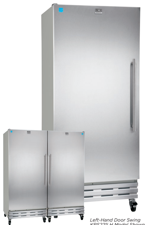
Left-Hand Door Swing KRS221LH Model Shown